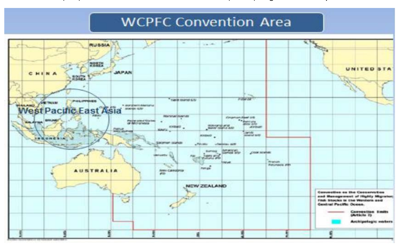
Exhibit 3: WCPFC Convention area including East Asian Seas<sup>2</sup>

The Western and Central Pacific Fisheries Commission (WCPFC) was established in 2004 as the relevant regional fisheries management organization (RFMO) in the Western and Central Pacific Ocean. The area of competence (Convention Area) of the Commission comprises all waters of the Pacific Ocean north and west of prescribed boundaries, to the coasts of Asia and is indicated in Exhibit 3 below, which includes the East Asian Seas (EAS) as well as the Pacific Ocean Warm Pool (POWP) Large Marine Ecosystems.