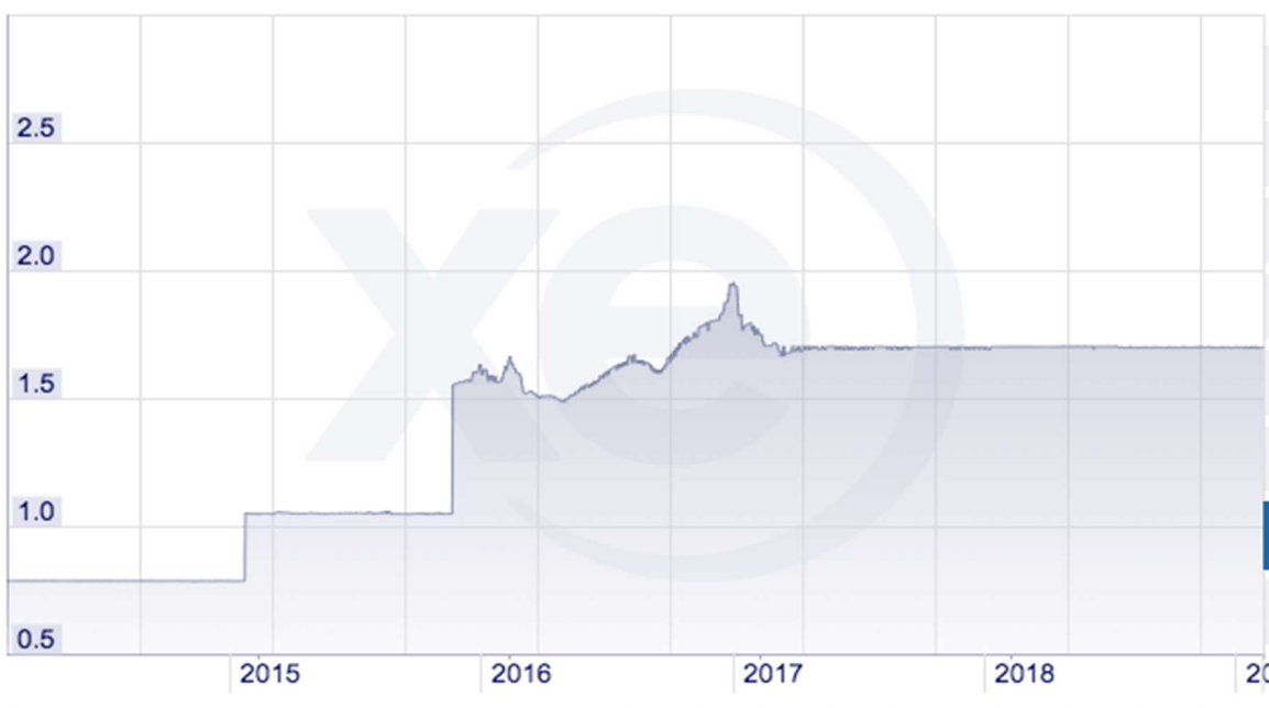
Figure 4 USD vs Azeri Manat Exchange Rate During Project Implementation