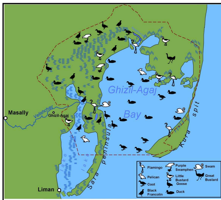
Figure 2 Contextual Map of Gizil-Agaj PA Complex

48. The project strategic results framework, with expected indicators and targets, is included in the project document (pp. 59-62). The project results framework represents the primary foundational element for assessing project results (progress toward the expected outcomes and objective) and effectiveness.