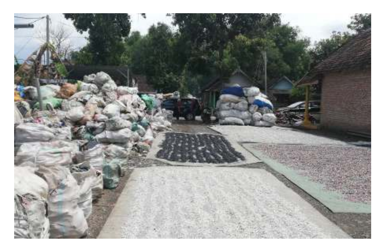
Figure 1. In the Kajagan village, Mojokerto, several farmers shifted from agriculture to plastic recycling. Here, shredded plastic after floating selection drying at the sunlight.