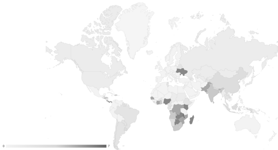
Figure 2. Density of follow-up activities ongoing or completed by country 2012-2019

This geographic mapping of follow-up activities is based on tracking data that UNDP has been collecting since the inception of this work. These activities, with the global frequency of their implementation in parentheses include: empowering key populations to promote human rights based HIV approaches (45), LEAs (41); dialogues with and capacity strengthening of law enforcement officials (41), national dialogues (34); dialogues with and capacity strengthening of parliamentarians (26); law review and legal scans (25); dialogues with members of the judiciary (22); sensitization and dialogues with other key stakeholders (19); civil society engagement scans (5). 381 These nine types of activities can be seen to be directly connected to the recommendations of the Global Commission, and the work necessary to support legal change.