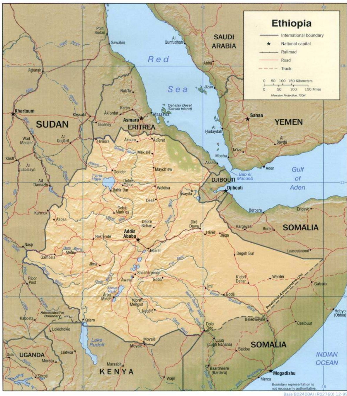
Figure 1: Map of Ethiopia