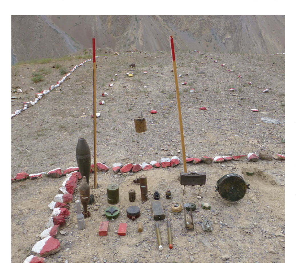
Tajikistan Ministry of Defence clearance operation in the Vanj district near the border with Afghanistan and the village of Yazghulom.

The study was guided by a theory of change (see Annex 2) and questions based on the evaluation framework of the Development Assistance Committee (DAC) of the Organisation for Economic Co-operation and Development (see Annex 3). Free-flowing semi-structured interviews were used to elicit information from key national and international stakeholders at the national and district levels. Separate focus group discussions (FGDs) using a participatory approach were