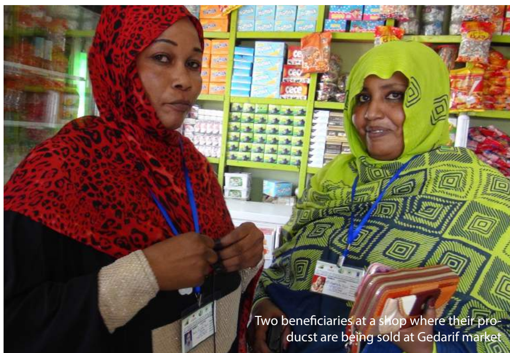
Two beneficiaries at a shop where their products are being sold at Gedarif market