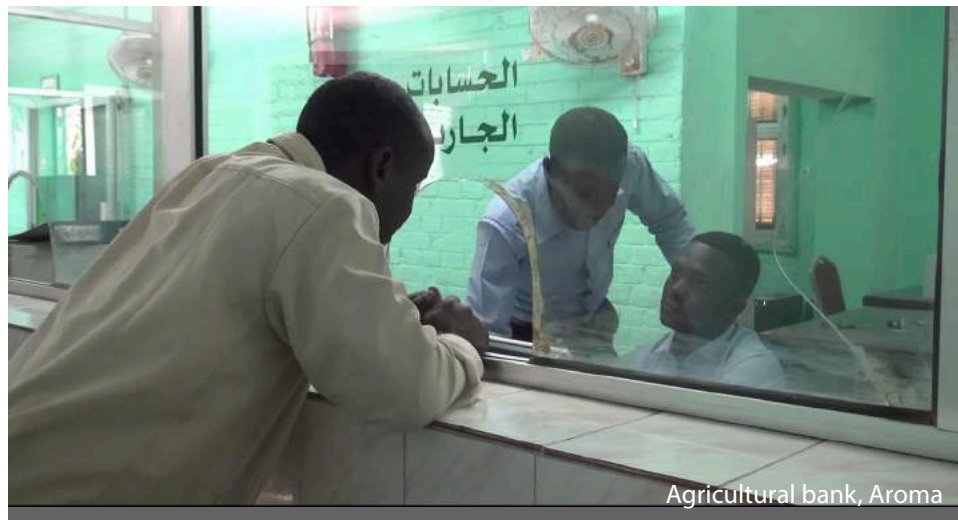
Agricultural bank, Aroma

More than 70 ladies with an artistic penchant could learn and improved their henna tattooing skills for around a month. Henna tattooing has become a popular business and a good source of income for ladies in Sudan.