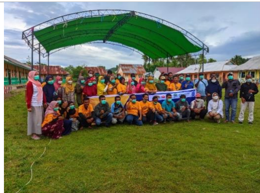
Figure 38. Photo-taking of all participants in attendance (1)