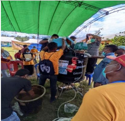
Figure 15. Process of adding the ore into the equipment