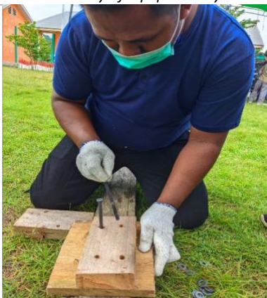
Figure 11. Assembly of equipment by miners (3)