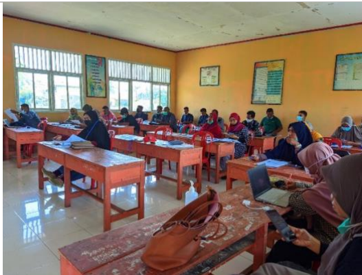
Figure 3. Pre-Test taken by miners