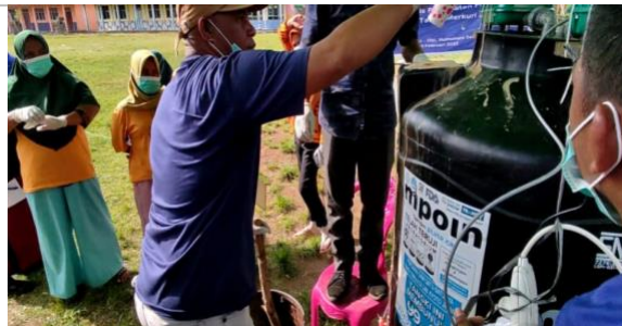
Figure 17. Process of adding the lime