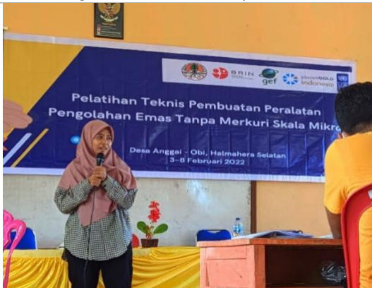
Figure 5. Presentation of material by Trainer (2)