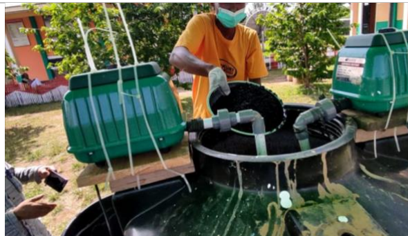
Figure 26. Adding carbon into the equipment