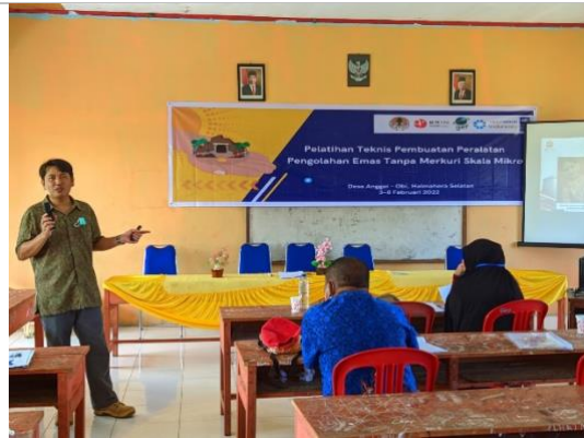
Figure 4. Presentation of material by Trainer (1)