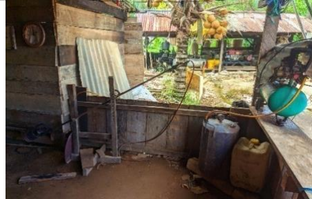
Figure 34. Carbon smelting equipment