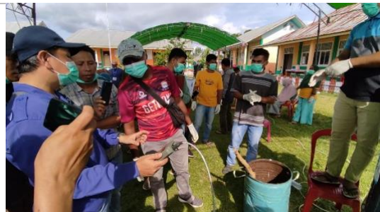
Figure 18. Instructions from the Trainer in using the Multimeter