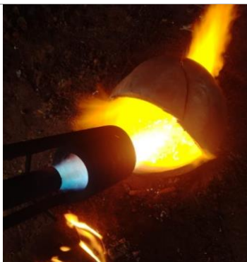
Figure 35. Carbon smelting