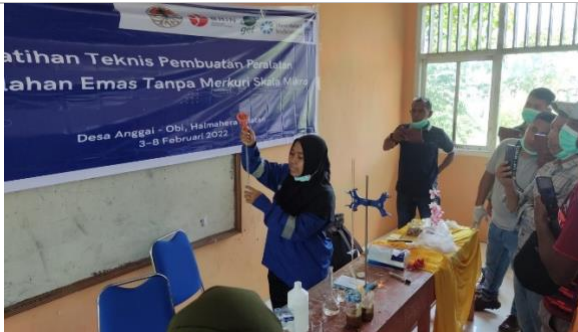
Figure 23. Presentation of technical material by Trainer to determine free cyanide levels (2)