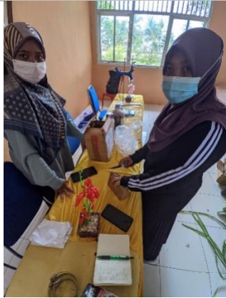
Figure 1. Checking tools and materials before the technical training