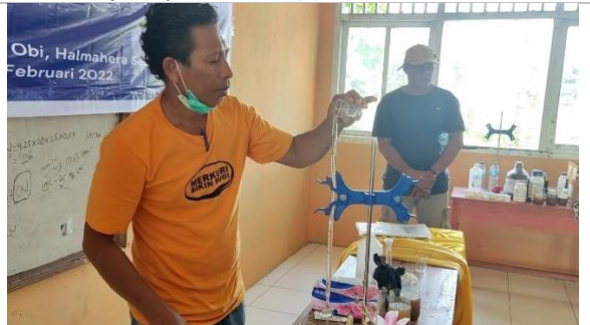
Figure 24. Determining free cyanide level by miner