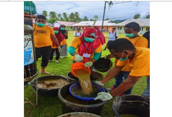
Figure 28. Removing carbon from the equipment (2)