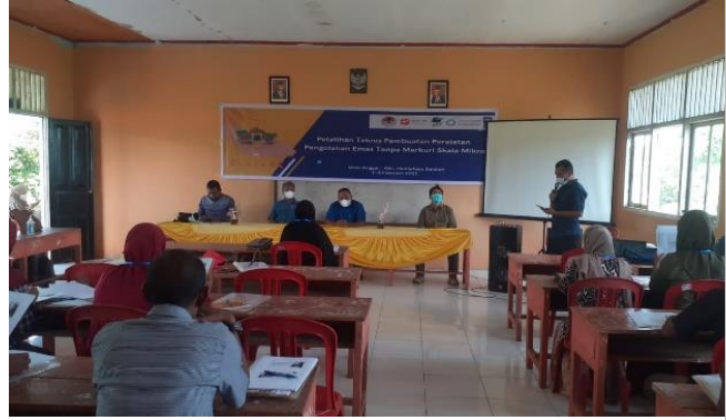
Figure 2. Opening of the event by UNDP Focal Point and local stakeholders