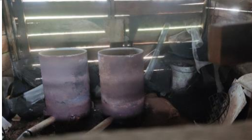
Figure 33. Carbon burning equipment