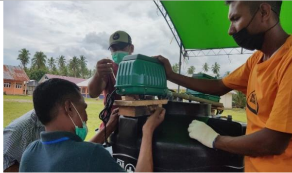
Figure 13. Assembly of equipment by miners (5)