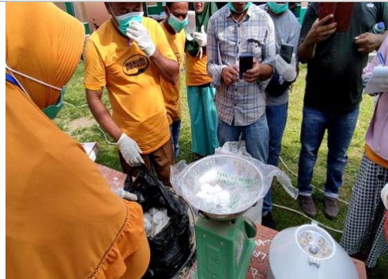
Figure 16. Weighing of chemicals