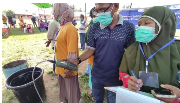
Figure 19. Use of multimeter by miners (1)