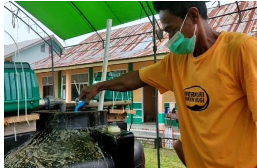
Figure 30. Addition of copper sulfate as a waste detoxification catalyst