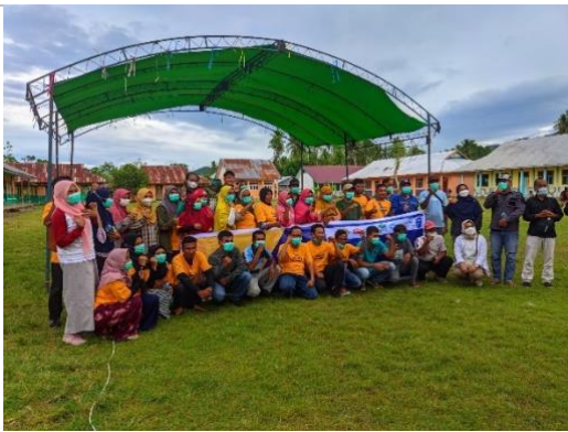
Figure 39. Photo-taking of all participants in attendance (2)