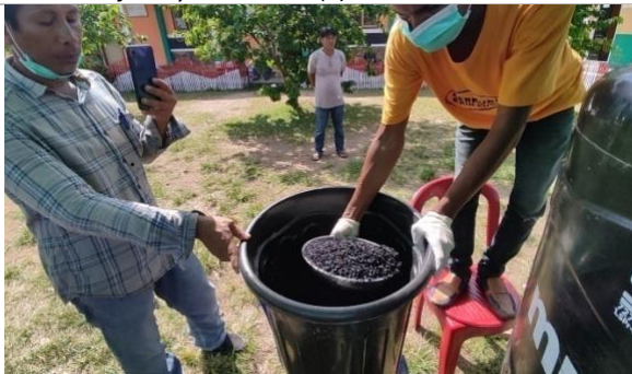
Figure 25. Preparation of adding carbon