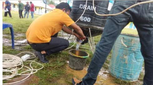
Figure 32. Removal of detoxified cyanide waste