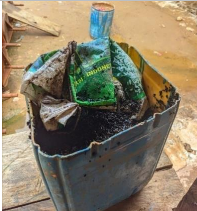
Figure 29. Carbon that is ready to burn