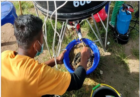
Figure 27. Removing carbon from the equipment (1)