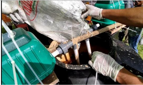
Figure 21. Process of adding cyanide