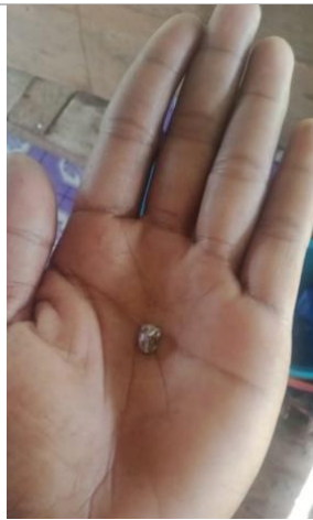
Figure 37. Gold produced from training