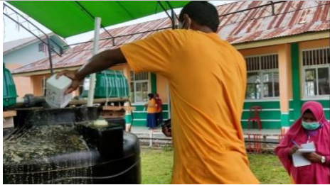
Figure 31. Addition of SMBS to reduce free cyanide