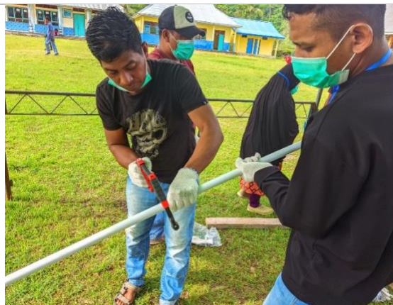
Figure 9. Assembly of equipment by miners (1)