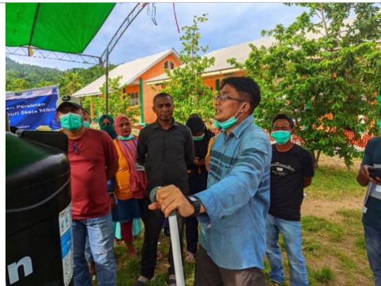
Figure 6. Instructions from Trainer for assembly of equipment(1)