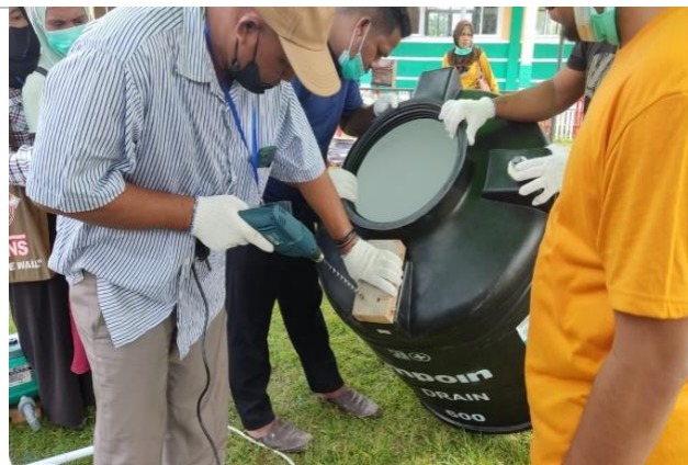
Figure 12. Assembly of equipment by miners (4)