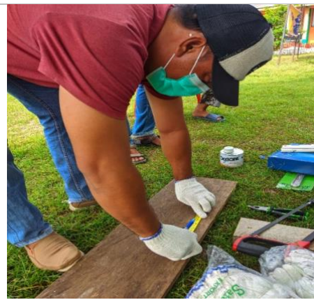
Figure 10. Assembly of equipment by miners (2)