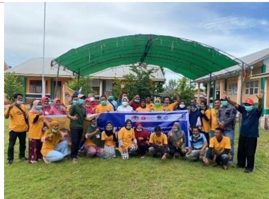
Figure 40. Photo-taking of all participants in attendance (3)