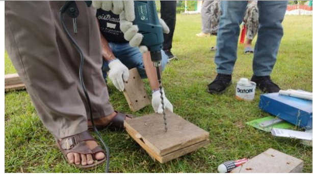
Figure 8. Assembly of equipment by miners (1)