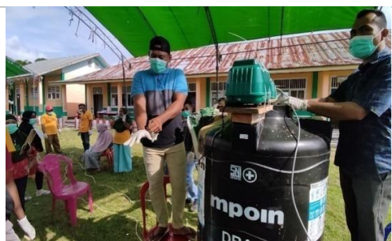
Figure 20. Use of multimeter by miners (2)