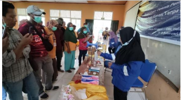
Figure 22. Presentation of technical material by Trainer to determine free cyanide levels (1)