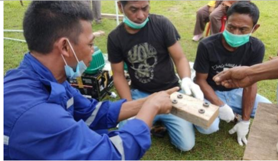
Figure 7. Instructions from Trainer for assembly of equipment (2)