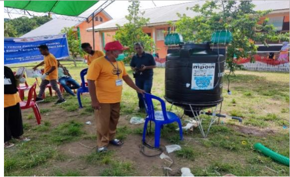
Figure 14. Equipment that has been assembled