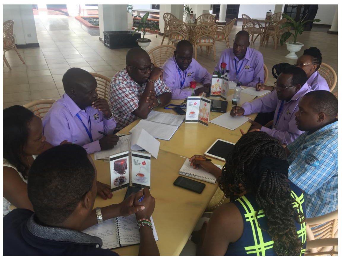
Technical Meeting between DFID, UNDP and the MODP's Monitoring and Evaluation Department